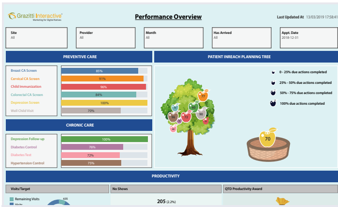
Performance Overview Dashboard